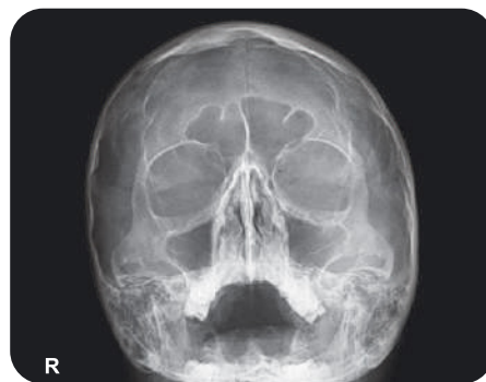
PNS waters view