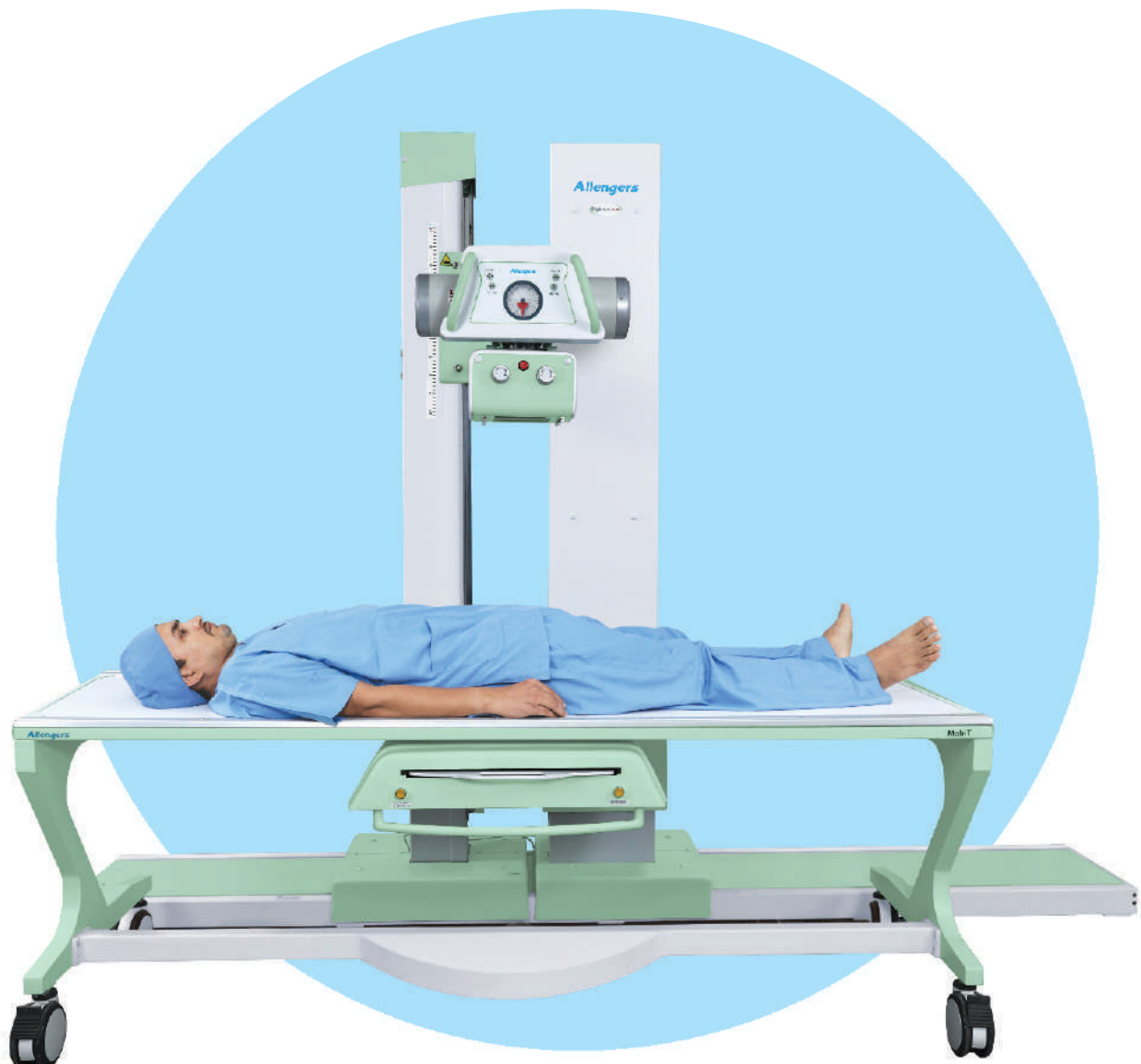
Ceiling Free System with the Detector Stand and Tube Column on Flat Rails along with MobiT Table.