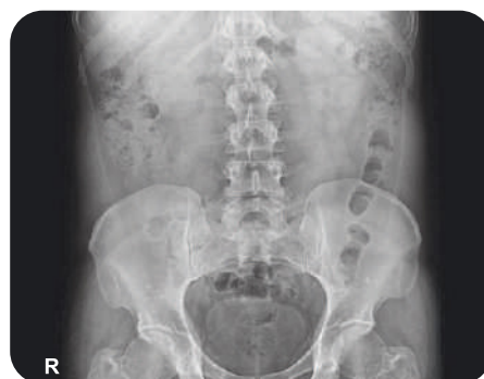
Abdomen Supine AP view