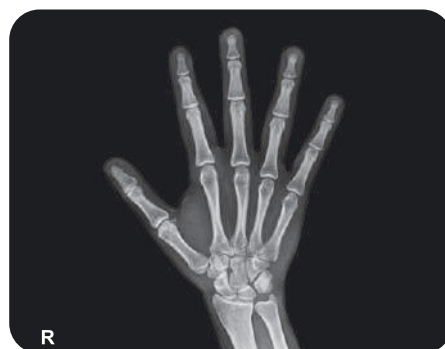
Right hand AP view