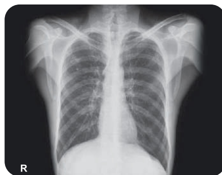
Chest PA view